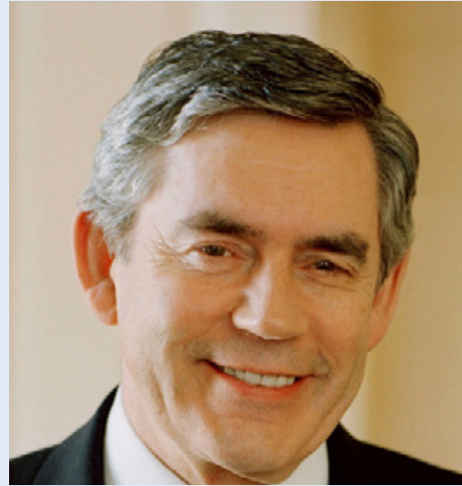
Rt Hon Gordon Brown