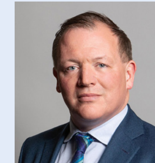
Damian Collins OBE Conservative MP