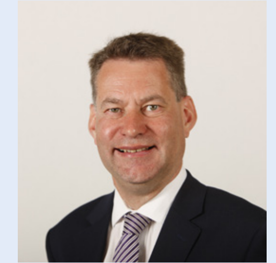
Murdo Fraser Scottish Conservative MSP